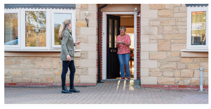
MORE THAN JUST A MEAL.

Participants are encouraged to contribute as they are able, but no one will be denied a meal on the inability to donate.